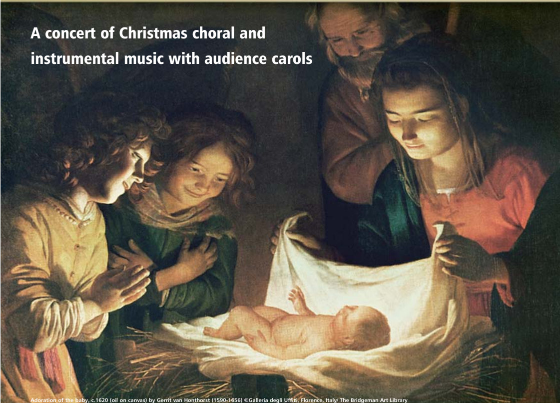
Adoration of the baby, c.1620 (oil on canvas) by Gerrit van Honthorst (1590-1656)

A concert of Christmas choral and instrumental music with audience carols